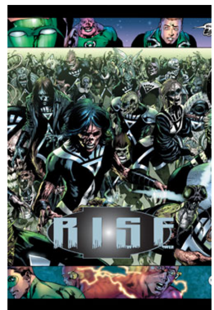
You Shouldn't Be Back