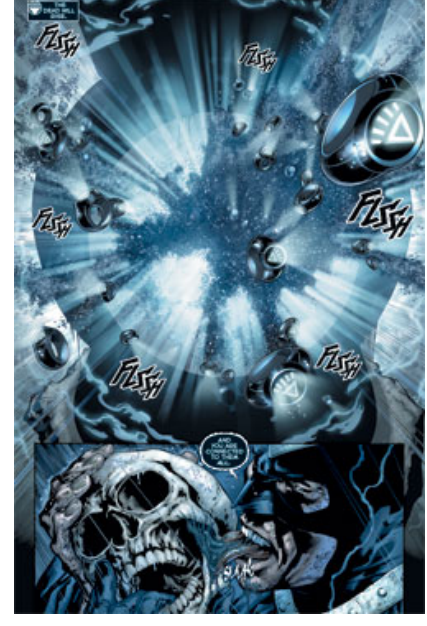
The Dead Will Rise