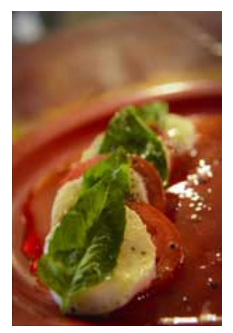
Click here for a larger image

This urban nature shot was taken in downtown Austin. What drew me to photograph this was the dichotomy of two very similar subjects. They are alike in the respect that they are both birds, but there the similarities end: the grackle is a noisy, cacophonous bird, while the dove is known to have a soothing coo. The two birds are also very different in color--the grackle being stark black and harsh, while the colors of the dove are muted and softer. When looking for subjects you don't have to completely rely on visual aspects to get your point across. Pairing two well known, but completely opposite objects can make a psychologically and visually interesting photograph. Taken with a Nikon 300mm f/4 for 1/500 @ f/4, ISO 360.