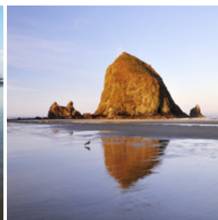
Museums and Lodging [PDF]