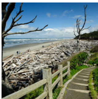
Driving Tour [PDF]

Click on the photos below to download printable guides from the travel experts at Fodor's [PDF].